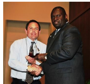
Pictured right: Diversity Advocate Award— NCDOT Division Seven