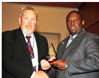
Prime Contractor Award Rea Contracting, Inc.