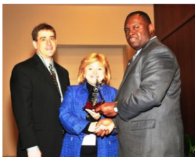
Small Architectural and Engineering Award Gibson Engineers, PC