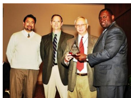
Architectural and Engineering Award Rummel, Klepper & Kahl, LLP