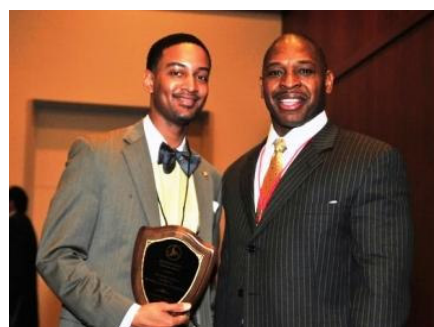
Platinum Conference Sponsor North Carolina Institute of Minority Economic Development