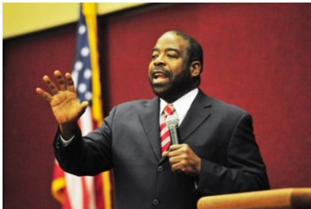
Motivational keynote speaker Les Brown encouraged conference attendees to make their own recovery.

Participants at the 2010 Transportation Conference were encouraged to shake off mediocrity and get “hungry” for success. Keynote speaker Les Brown admonished the audience to make their own recovery instead of waiting for the economy to recover.