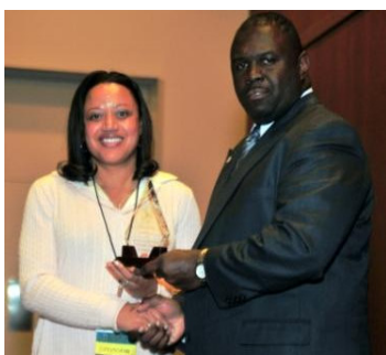
BOWD Partner Award North Carolina Coordinators Network